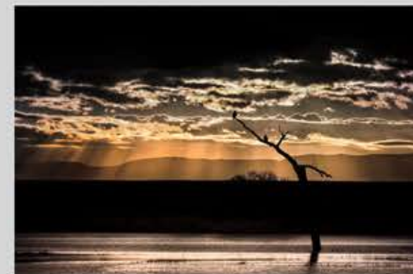
'Morning Watch' by Ken Duckert On view at Yucca Gallery