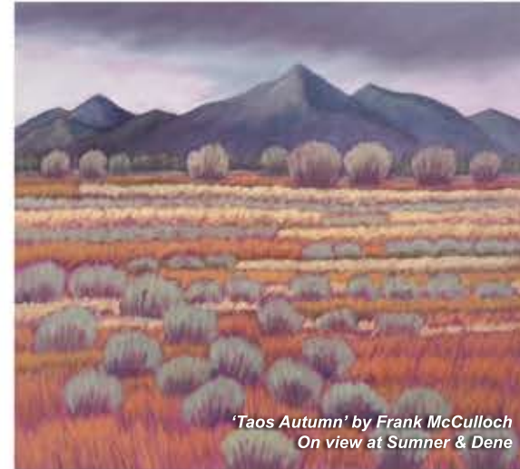
'Taos Autumn' by Frank McCulloch On view at Sumner & Dene

3812 Central Ave SE, Suite 100 A - 280.8659 - matrixfineartabq.com Featured Artist's Reception 5-8pm In his one-man show, New Mexico Inspired , renowned artist Paul Sanchez presents acrylic and watercolor paintings and sculptured clay works that capture his reverence for New Mexico's landscape and heritage. With steadfast respect for New Mexico, his earthy and colorful work pays tribute to a sense of reminiscence and community.