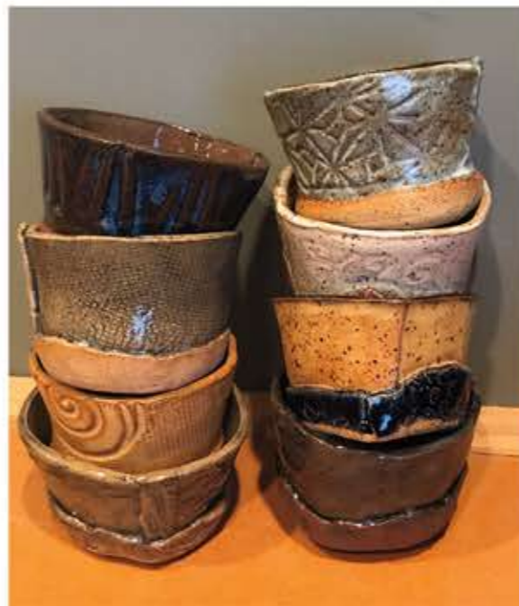
Bowls on view at Little Bird de Papel Sales benefit OffCenter Community Arts Project