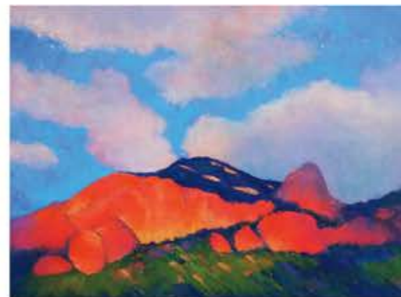
'Bien Mur' by Melinda Menka On view at Tortuga Gallery

The Hands exhibit features 19 panels, each 4 x 8 feet. The many photographs are of people's hands with something they hold dear and were created by a group of local photographers. The closing celebration for the Sandia Mountain Show is happening as well.