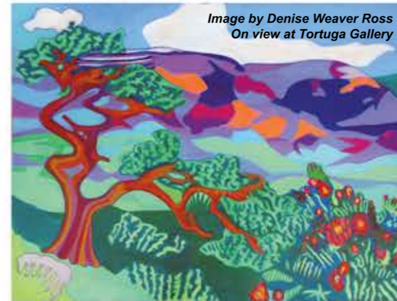
On view at Tortuga Gallery